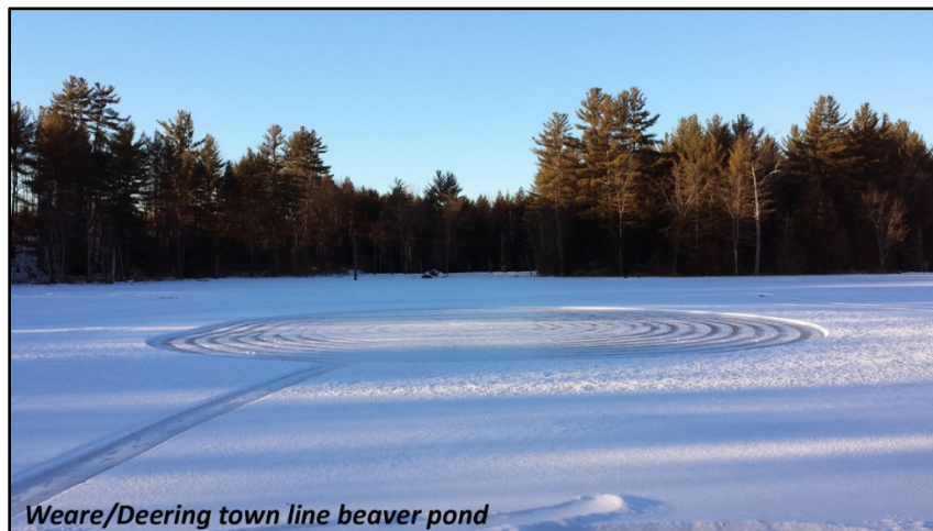
Weare/Deering town line beaver pond